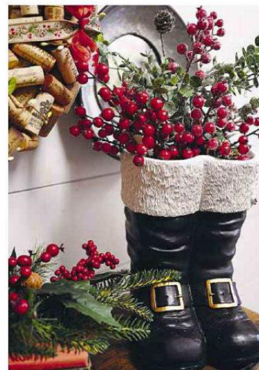
Santa's boots and other decorative items at Back In Time.

INFO 441 Main St., Farmingdale, 516-586-8443, backintimedecor.com