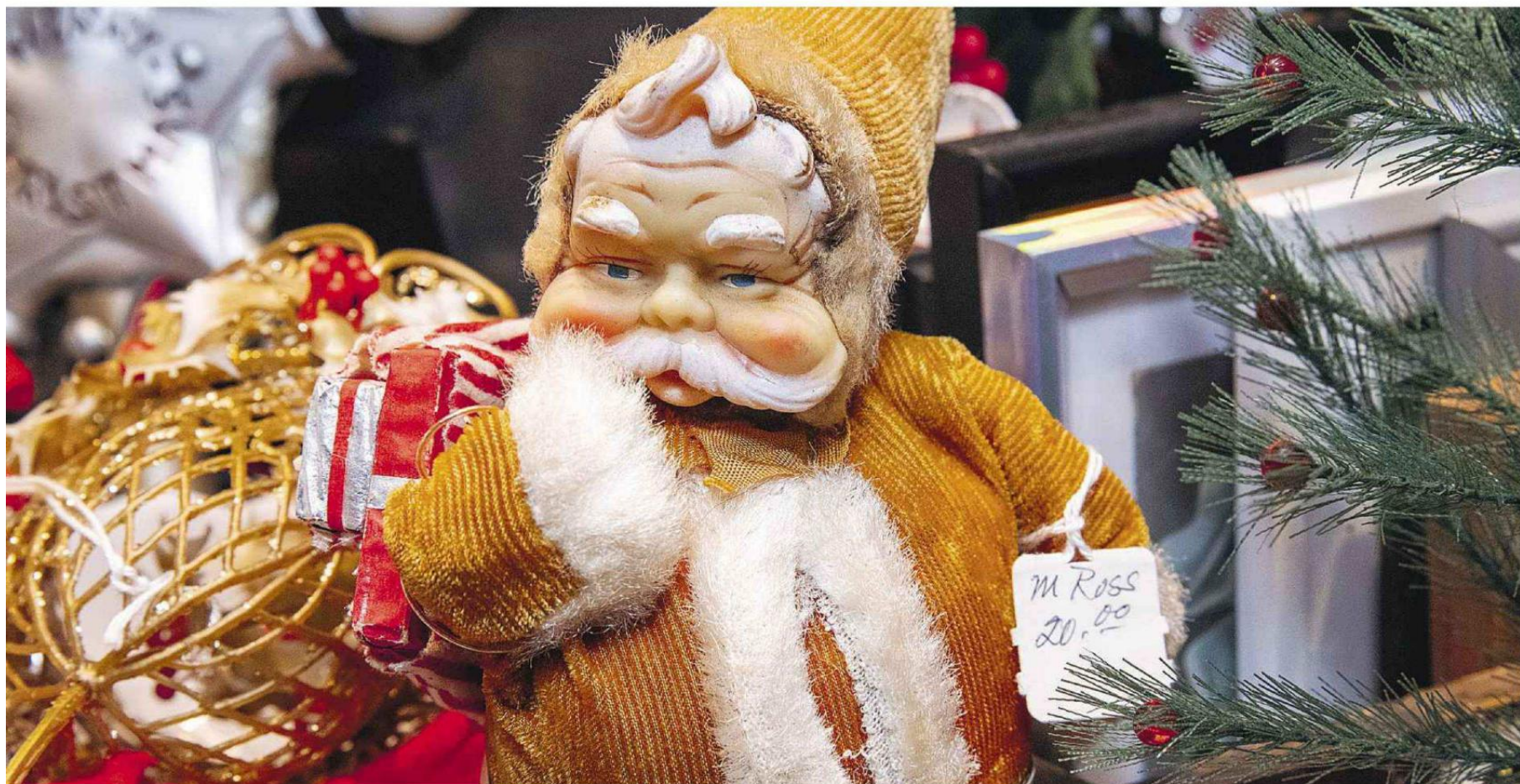
Holiday items for sale at Rosie's Vintage in Huntington. Most of the Christmas decorations at the store date from around the 1940s to the 1970s.