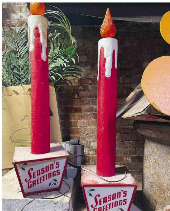
Electric candles at The Times Vintage in Greenport.