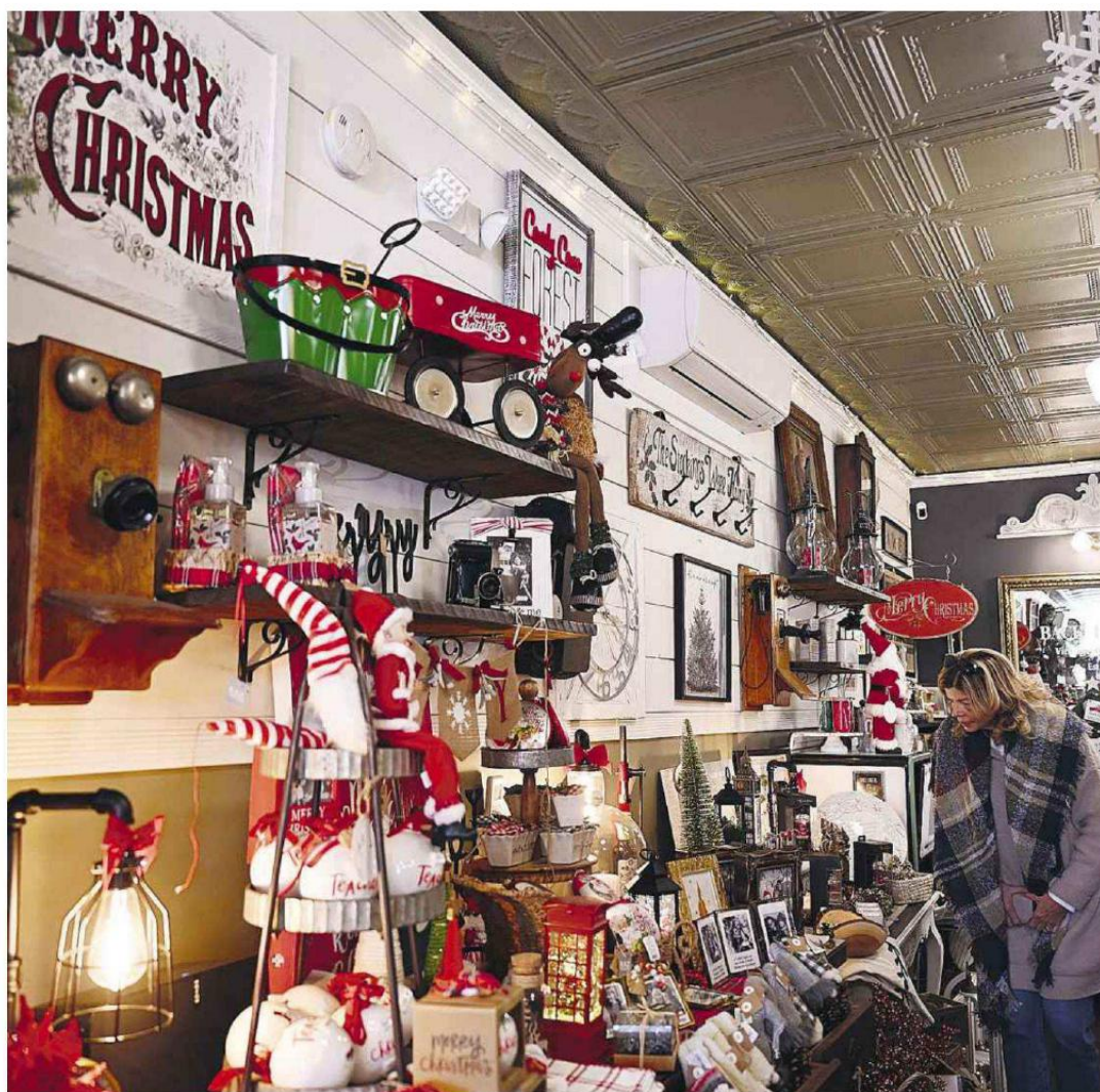
Back In Time in Farmingdale sells an array of vintage looking Christmas items.